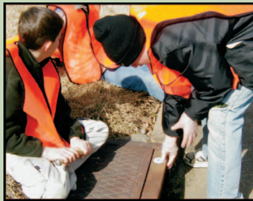
Storm Drain Marking

You can get involved with Adopt-A-Stream by simply contacting the Mississippi Wildlife Federation and expressing an interest in the program and becoming a Stream Steward!